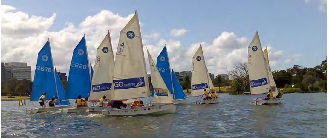
Pacers from both teams compete at the start of the 5th race.